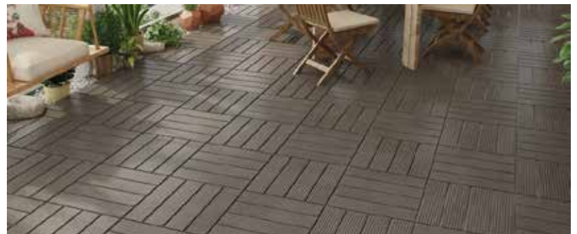
COMPOSITE DECK TILES IN CROSS HATCH PATTERN